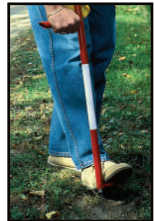
Flag Installation Tool

This sturdy tubular probe is perfect for placing flags in hard, rocky or frozen soil. The probe is designed to carry 100 flags in the handle for convenient installation.